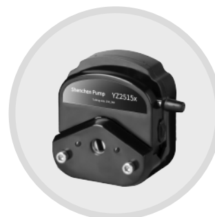
EasyPump Pump Head